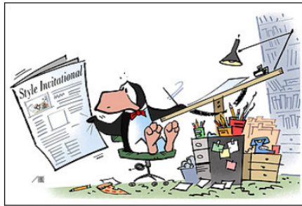
(Bob Staake for The Washington Post)

Here's a contest we've run twice before: to take a word in common usage and create a new definition for it. This contest, dating to 1998, has proved so popular that many of the printed entries from Week 266 and Week 564 are still in wide circulation today. For instance, the Sunday comic "Opus" by Berkeley Breathed (syndicated, totally coincidentally, by The Washington Post Writers Group) devoted both the Dec. 9 and Dec. 16 strips to such definitions as "abdicate: give up all hope for a flat stomach" -- every one of which was a Style Invitational entry from Week 266. (That one was by Tom Witte of Montgomery Village, in one of the more than 900 blots of ink he's dribbled over the years.) Breathed (rhymes more or less with "death head") did write "Style Invitational" on a newspaper in one panel of the Dec. 9 strip (but not the next week's), though he didn't give a hint what that phrase might mean.